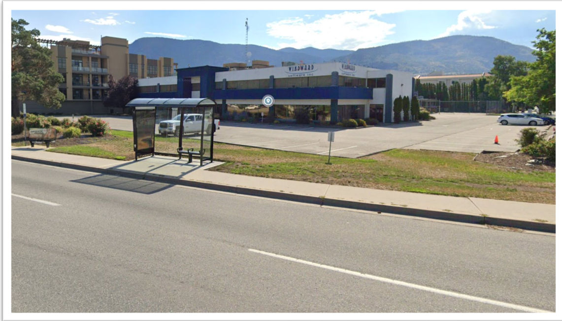
Figure 2 - 3547 Skaha Lake Road