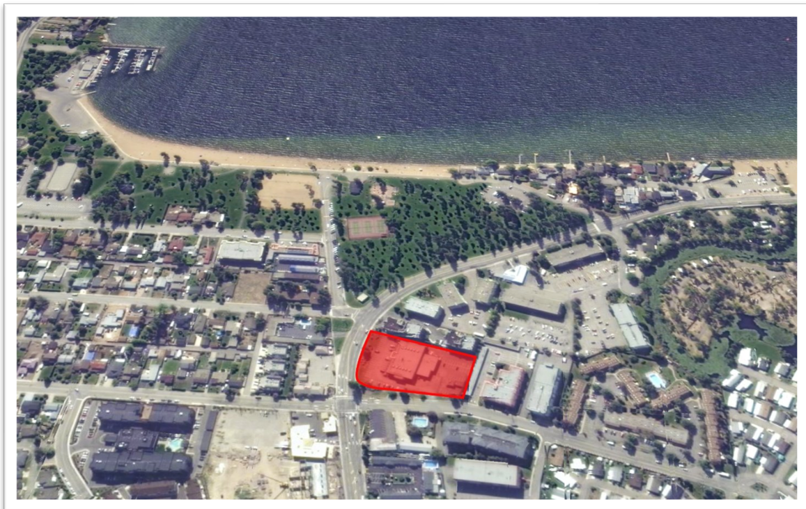
Figure 3 - 3547 Skaha Lake Road